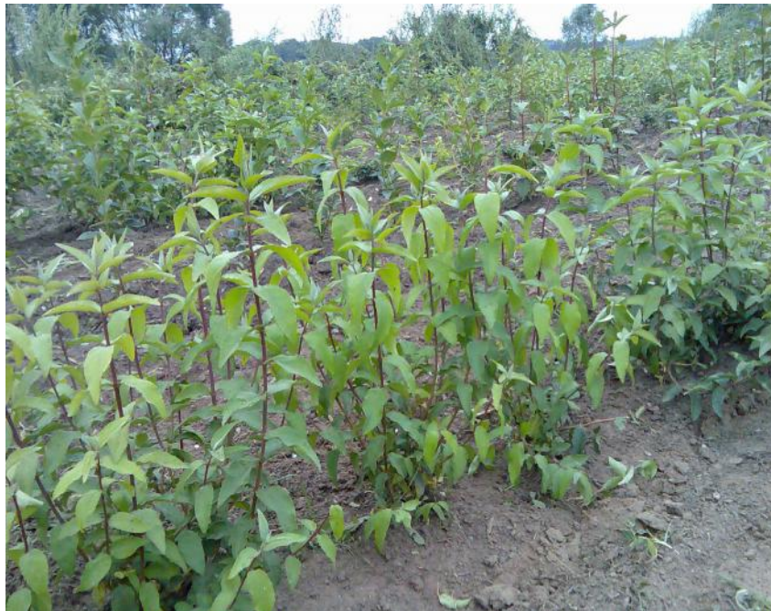
Fig. 5. Field cropping in low quality soils fertilized with various doses of certified sludge from a municipal treatment plant Author: Z. Romanowska-Duda.