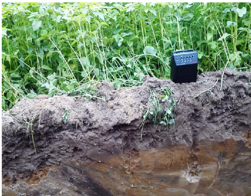
Fig. 3. The profile of the soil on which sunflower is grown mixed with legumes. Visible open canals hollowed by earthworms with crop roots growing in them vertically. Author: M. Grzesik

An important aspect of research in agro-ecotechnology is the development of a monitoring system for the diseases of energy crops, the diagnosis of their perpetrators, and the timely performance of plant protection treatments. The selection of stimulants of plant growth and their resistance to diseases and adverse agrometeorological conditions is also an important aspect. The problem of protecting energy crops against pests is very complex as it should concern the use of biological agents that effectively combat the perpetrators of diseases, while at the same time positively affect biomass yield and are environmentally friendly [8, 20, 21].