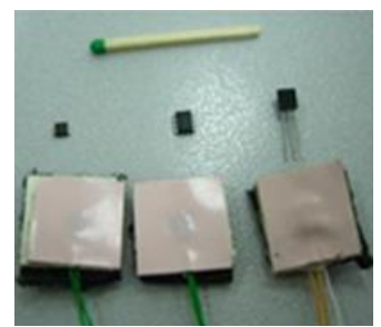
Figure 4. DS18B20 digital temperature sensors in flexible thermal conductive covers.

Another important matter is the proper implementation of a commercial sensor into a textile product and finding the appropriate base, compatible with the active layer, characterized by specific parameters. It is also important to provide a suitable encapsulation coating for the finished component that will protect it from the various operational exposures that result from the implementation within a textile product, such as moisture and chemical agents. From the point of view of mobile textronic applications, the less important parameters of digital sensors are their size and housing type, as well as the signal output system and their average and instantaneous power consumption during operation. Due to their comfort and functionality, such systems should, in addition to high static accuracy and good dynamics, be characterized by the smallest possible size and flexibility. <sup>71</sup> An exemplary digital textronic sensor is presented in Figure 4.