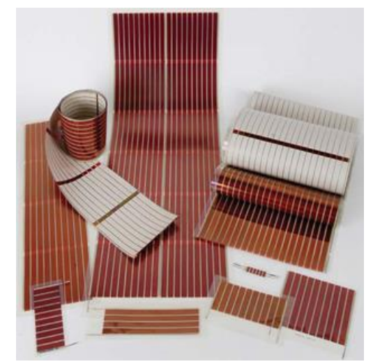
Figure 2. Flexible solar cells.

An exemplary flexible solar cell is presented in Figure 2.