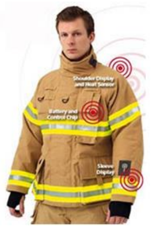
Figure 1. Intelligent fireman's outfit Four areas of innovation.

Textronic products integrate miniaturized electronics and specialized electronic systems with fabric into one functional unit. Its typical applications include smart formulated products and protective products, which do not differ much from usual outfits at first glance. However, after careful observation, everyone can notice the integrated sensor networks, linked to electronic control systems for internal and external parameters of the attire, which can significantly improve functionality and improve its protective parameters<sup>61</sup>. An exemplary textronic product is presented in Figure 1.