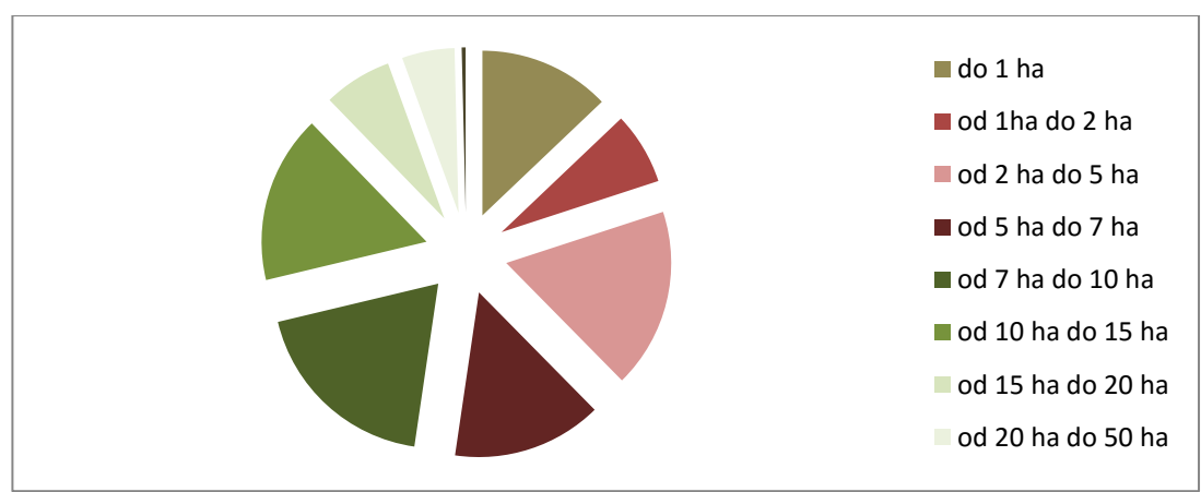
Graph 1. Agrarian structure in Daszyna commune.