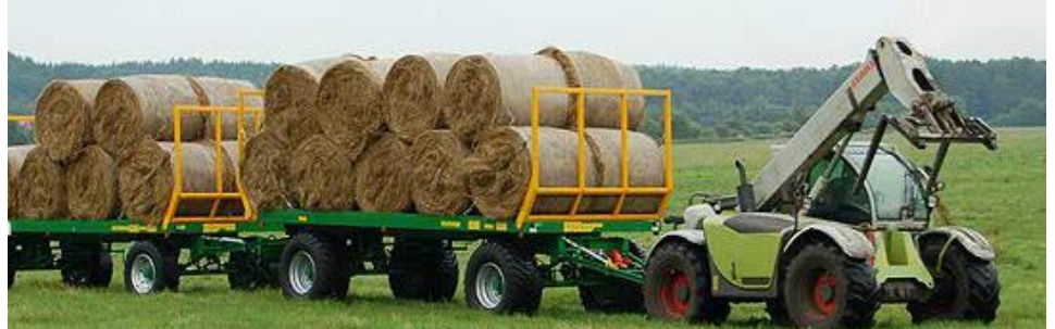
Figure 3. Method of realization of transport deliveries to the planned CHP plant in Daszyna.

Companies producing straw transport platforms have a trailer with a load capacity of over 13.7 tons (e.g. T026 from Pronar<sup>13</sup>). They have a loading platform measuring 2.43 x 10.77 m, which makes it possible to place on the trailer, with 3 bales stacked on each other (height), 54 cubic bales (8.1 tons) of the size and weight intended for delivery to the CHP plant. So, to meet the daily straw demand for the planned CHP plant in Daszyna, in one transport there will be two trailers needed with the dimensions given above, connected one following the other and towed by one vehicle. An example of this is shown in Figure 3.