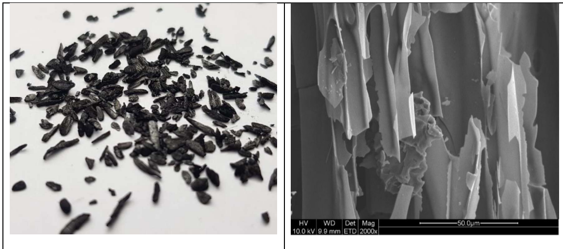
Fig. 2. Biochar particles image (left) and scanning electron microscopy (right, taken at Tel-Aviv University)

The biochar created is a stable carbon black solid that is highly porous with large surface area (Fig. 2.). More than 70 percent of its composition is carbon [19]. The biochar's chemical composition varies with feedstocks used to make it and methods used to heat the biomass. The pyrolysis process varies as it can be done with different conditions as burning temperature and burning time, reactor volume, other gasses and materials in the reactor [20]. However, different thermochemical processes can be also used for biochar production [18]. Compared to activated carbon, biochar can be created from various types of biomass, requires less energy in the production process and consequently can provide a solution in the treatment of textile wastewater in poor income countries.