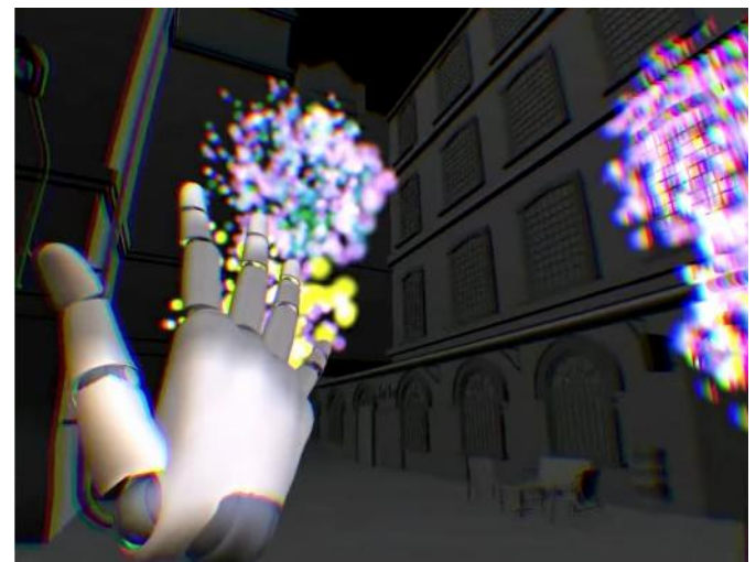
Fig. 3. User interacting with environment - painting the location with gestures.