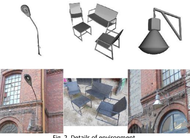
Fig. 2. Details of environment.

Scenario, and the whole interaction were developed within the Unity game engine. The use of an existing game engine allowed us to focus on designing the experience and is sufficiently robust and open to further alterations. Suitably, it has the official support for Leap Motion and Oculus Rift. However, since we utilized the DK2 version of Rift (development kit 2), not everything was out-of-the-box and some work was required to assure that both devices are working together properly. The effect of paint was achieved with particle effects. Emitters were set to trigger paint emissions when a swipe gesture is recognized with the Leap Motion controller. The generated particle colors were randomized to make the whole experience more interesting. "Paint" stuck to the surface of our models on touch and was affected by gravity. This idea for the scenario is based on the thought that among the basic needs common to humans is the need to create, alter the surroundings. Changing the color of the environment through movement is easily recognizable. We believe that users will easily link those in cause-effect chains, which should result in further acceptance of the presented virtual environment. To assure that user is undistracted and focused on his surrounding and task given no Head-Up Display (HUD) was used. That means that interface consisted of modeled world, paint (visible after proper gesture is executed), hands models, and input devices.