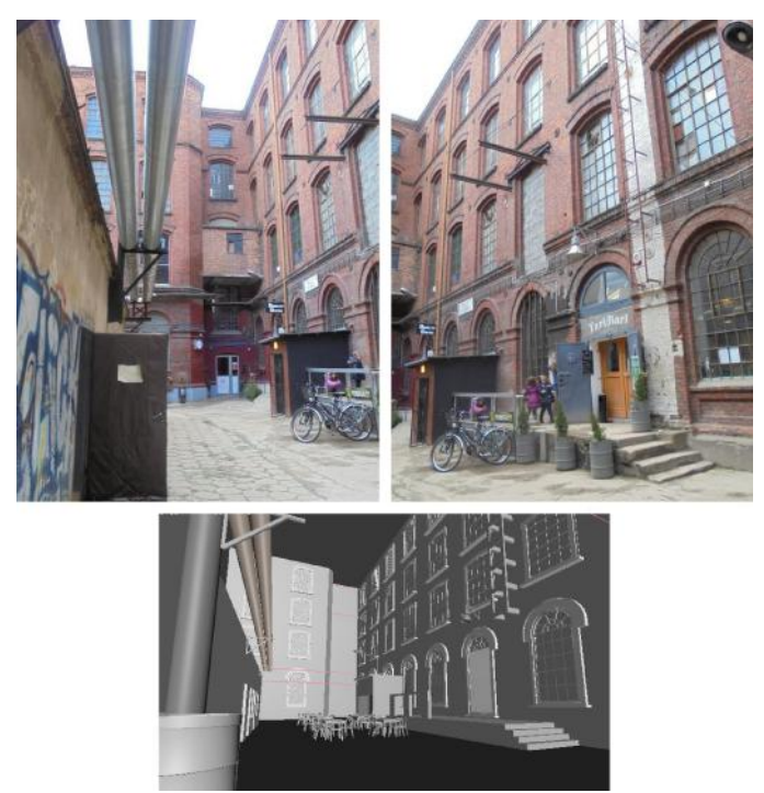
Fig. 1. Real picture of location used and render of modeled location