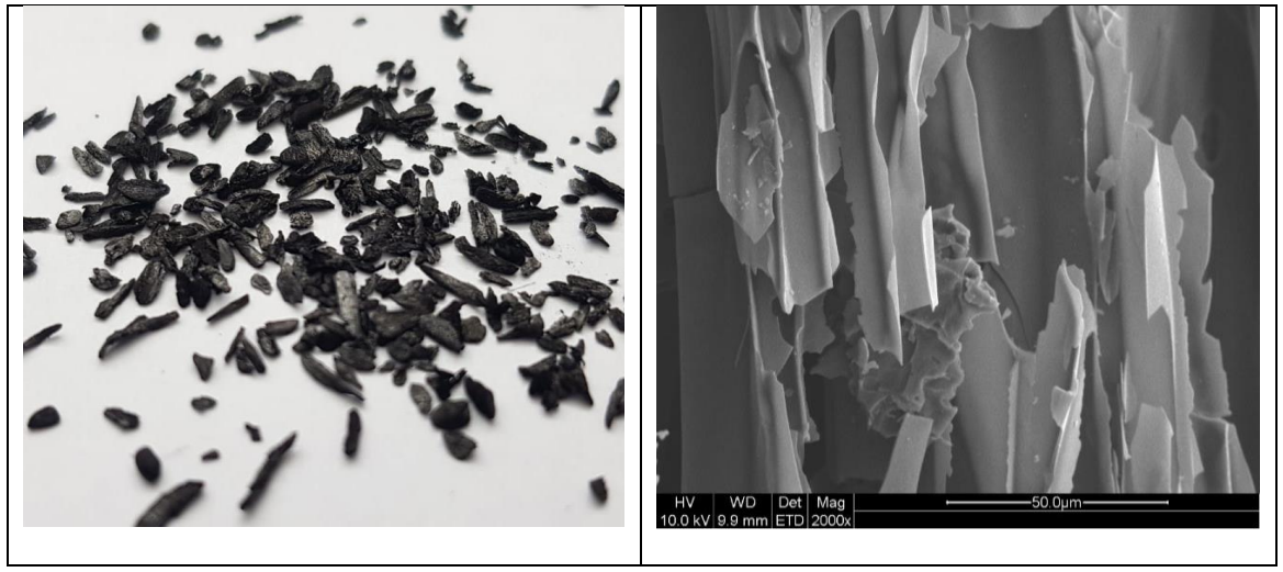
Fig. 2. Biochar particles image (left) and scanning electron microscopy (right, taken at Tel-Aviv University)

The biochar created is a stable carbon black solid that is highly porous with large surface area (Fig. 2.). More than 70 percent of its composition is carbon [19]. The biochar's chemical composition varies with feedstocks used to make it and methods used to heat the biomass. The pyrolysis process varies as it can be done with different conditions as burning temperature and burning time, reactor volume, other gasses and materials in the reactor [20]. However, different thermochemical processes can be also used for biochar production [18]. Compared to activated carbon, biochar can be created from various types of biomass, requires less energy in the production process and consequently can provide a solution in the treatment of textile wastewater in poor income countries.