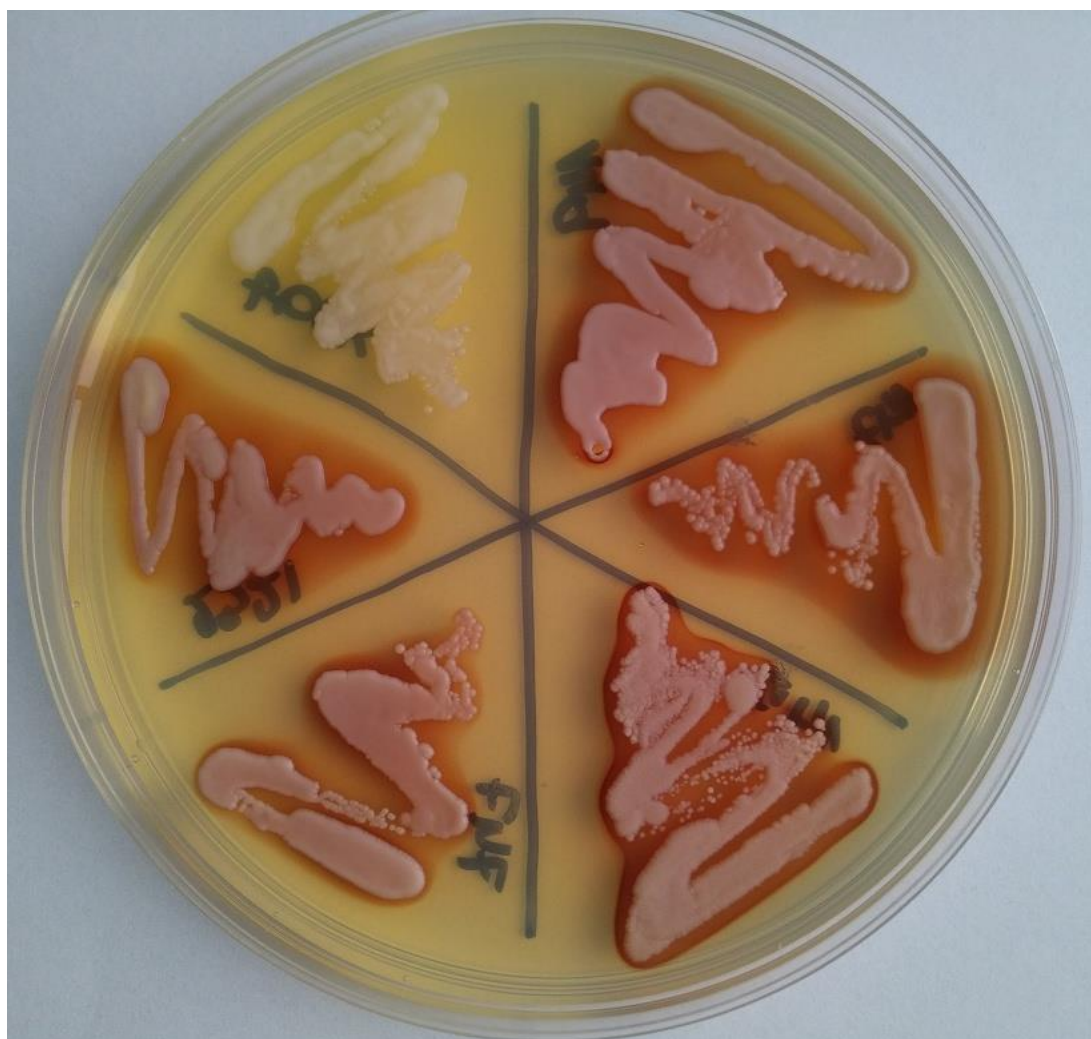
Fig. 1. Production of red pigment by the tested Metschnikowia pulcherrima strains in YPG agar medium supplemented with \text{Fe}^{3+} ions (0,015mg/ml). A Wickerhamomyces anomalus strain without pigment production was used as negative control.