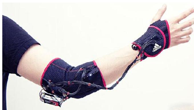
Fig. 10 The 'Ghost' system for stimulation of blind people's hand movements Source: [27]

movements. Until now, trainings consisted in directly moving hands and legs, so that the blind person could remember particular movements and muscle work. Scientists at Imperial College London have developed a device for vibratory feedback, which teaches blind people how to make precise repeatable movements without the presence of a trainer. The 'Ghost' system is able to 'remember' certain movements demonstrated by the trainer. On this basis, an athlete can practice these movements which are monitored on an ongoing basis in terms of accuracy, guided by vibration and sound signals (Fig. 10)