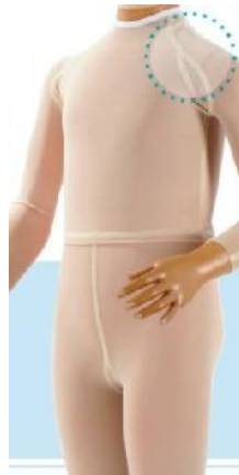
Fig. 6 Codopress® garment