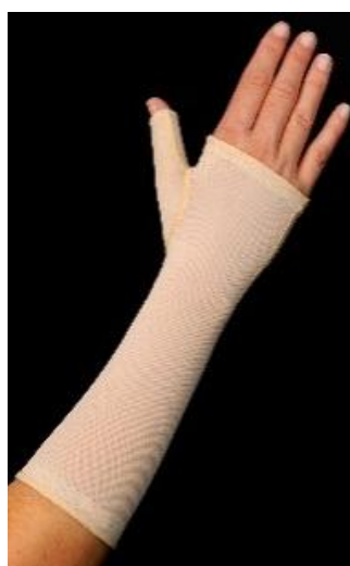
Fig.3 Seamed compression product

The group of products of the type fitted to the user's body includes knitted bands, also in seamless form. They are used to stabilize parts of the body such as wrists or other joints (knee, ankle) (Fig. 4). They provide adequate stiffening and compression at the early stages of degenerative disease as well as during chronic, post-traumatic or postoperative irritations in the joint area [5]. They are also used in prevention to save the occurrence of injuries e.g. during practicing competitive sport. These products, in addition to performing the assumed function, thanks to the use of a variety of raw materials, ensure comfort of use. These include additional features such as moisture dissipation, which ensures antibacterial properties, as well as the introduction of the anti-rheumatic function through the addition of a natural ingredient such as amber (enrichment or fiber) or minerals providing a thermal effect by raising the body temperature, which can further contribute to the process of improving health.