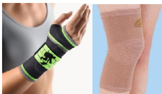
Fig. 4 Stabilizer of the wrist and knee Source: [16]

The group of products of the type fitted to the user's body includes knitted bands, also in seamless form. They are used to stabilize parts of the body such as wrists or other joints (knee, ankle) (Fig. 4). They provide adequate stiffening and compression at the early stages of degenerative disease as well as during chronic, post-traumatic or postoperative irritations in the joint area [5]. They are also used in prevention to save the occurrence of injuries e.g. during practicing competitive sport. These products, in addition to performing the assumed function, thanks to the use of a variety of raw materials, ensure comfort of use. These include additional features such as moisture dissipation, which ensures antibacterial properties, as well as the introduction of the anti-rheumatic function through the addition of a natural ingredient such as amber (enrichment or fiber) or minerals providing a thermal effect by raising the body temperature, which can further contribute to the process of improving health.