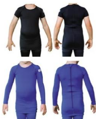
Fig. 1 Compression orthosis of the torso

This use is very important from the point of view of many branches of patient's health improvement with the use of textiles with standardized properties of compression on selected parts of the body. Compression products are based on knitting technology. These are mostly products manufactured based on the row knitted fabrics technique on double-bearing cylindrical machines with the use of elastomeric yarn. They are designed as wholegarment products or are used for making garments, in order to adjust the product to a given part of the body as much as possible. As serving to improve health, they are widely analyzed and examined, so that the design of the product and its compression features have strictly defined health functions in terms of the pressure on the patient [2 - 12]. One of the solutions used for improving children's health in terms of sensory feelings are products suited to the child's body in the form of flexible orthoses Hylton® Orthotics (Fig.1). They provide support of the child's body and its balance, as well as its response to deep pressure by improving the control of muscle tone and respiratory mechanics. They help reducing reaction time and in involuntary movements, as well as in auto-stimulation behaviors.