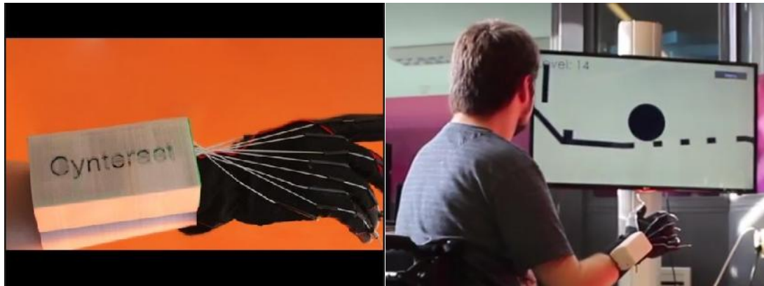
Fig. 8 Cynteract glove for rehabilitation exercises aimed at improving motor performance of the hand

One of them is the so-called Cynteract – a rehabilitation system developed for the hand, consisting in wearing gloves and exercising hand fitness in virtual reality. The system consists of a glove, sensors placed at the ends of its fingers and a tether running along each finger to the control system. It is used for treating hand injuries by controlling their movements, in accordance with a programmed set of exercises. With the help of the orientation sensor placed in the glove, the position of the hand in the room is followed. The position of the strings enables the sensors to precisely detect the movements and bending of each finger. This allows to make exercises in accordance with the rehabilitation program presented in the virtual reality on the screen [23].