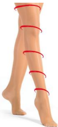
Fig. 2 Anti-varicose stocking

Among products with compressible properties, a wide group are pantyhoses with anti-varicose and anti-edema properties. Designed as products with configurable compression, they provide adequate pressure on the body for proper circulation in the lower parts of the body, in pressure classes from 10mmHg to 32mmHg. The most important task of anti-varicose stocking products is to exert a specific pressure on the patient's legs in order to force the venous blood from the lower parts of the legs towards the heart [2-4, 9] (Fig. 2). These products are designed both as seamless and with the use of a flat seam to provide constant configurable compression [14-15] (fig. 3). Products in the form of pantyhoses, stockings or knee-length socks can also provide a preventive effect for people who work in a standing and sitting position, especially those with strictly medical direction for treatment of lower limb varicose veins.