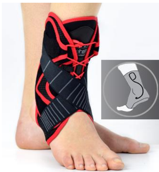
Fig. 5 Semi-rigid orthosis Source: [17]

While discussing the functions of textile products in rehabilitation in terms of immobilization of the patient's body parts, it is necessary to emphasize the role of textiles in the construction of a wide group of products with a stabilizing function in the form of orthoses. These are rehabilitation devices used as orthopedic apparatuses for immobilizing joints, body sections or muscle groups, usually replacing plaster dressing (Fig. 5). Their main task is to ensure a stable position of the joints of the limbs which have been injured e.g. sprains, dislocations or ligament ruptures [6-7]. Regardless of the structure of these products, which can be divided into rigid, semi-rigid (semi-flexible) and soft (elastic), textile materials in the form of woven fabrics, knitted fabrics and tapes play a fundamental role in the composition of orthoses.