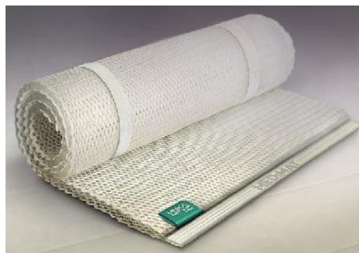
Fig. 7 The MEDiMAT® anti-bedsore overlay

One of the effective solutions aimed at preventing the creation of bedsores is a textile product made of technical knitted fabric, namely the MEDiMAT® anti-bedsore bed overlay (Figure 7). It is a 'wholegarment' form of 3D spacer knitted fabric with dimensions of 90cm x 200cm. Thanks to its spatial form and the structure made of a series of densely arranged monofilaments connecting the upper and lower layers of the flat knitted fabric, it gives the product its elasticity and is a very good substitute for foam. The structure of the product is openwork and highly deformable. It creates a layer between the patient's body and the bed that is permeable to air and moisture. Thanks to these features, it helps to protect the patient from pressures and bedsores, as well as improves the health condition when such inconveniences already exist [21].